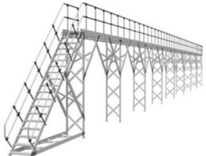
Buses, trains & commercial vehicles