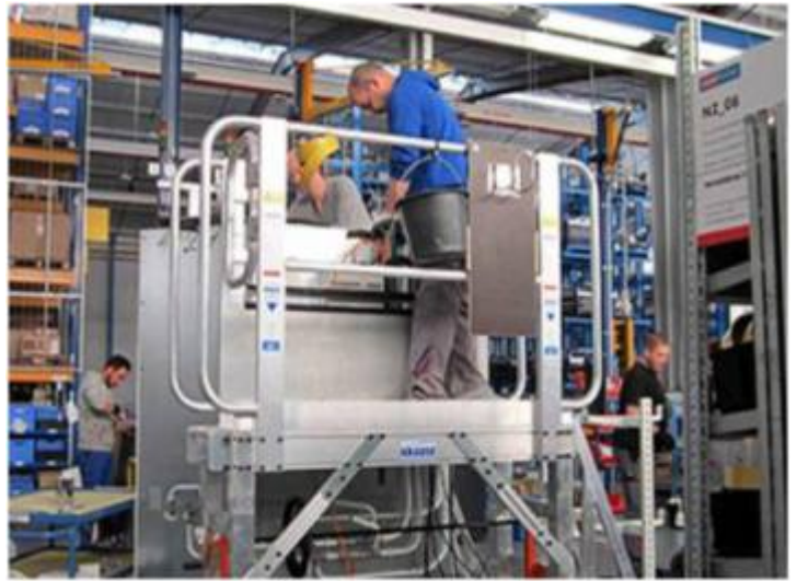
Project reports customised solutions

You may get all your needs met thanks to YOUNGMAN's consulting experience. From analysis to design, implementation, and services, our professionals will handle your concerns in a professional manner and have years of experience.