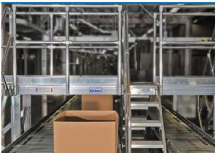
Customised solutions made of aluminium for industry & systems engineering

We deliver the finished product, execute the acceptance, and, if necessary, install the gadget on-site.